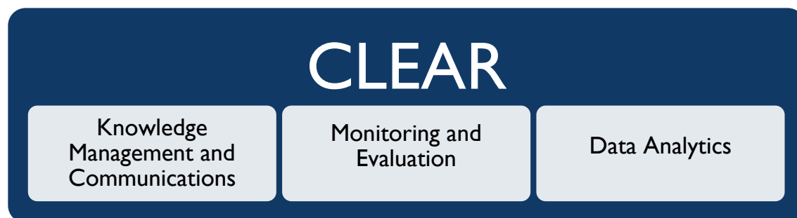
Exhibit 7. CLEAR team composition

The Monitoring and Evaluation unit is primarily responsible for all centrally managed M&E activities. This unit develops and rolls out M&E policies, procedures, tools, templates, and methods; provides training and guidance to in-country M&E personnel; and ensures data quality. The M&E unit works in close collaboration with the MIS team to ensure that ARTMIS forms and dashboards accurately capture and display indicator information. The team also works across headquarters technical and functional units to ensure that teams have the data they need to identify problems, make decisions, and evaluate progress toward the project’s objectives. Members of the M&E unit also conduct short-term technical assistance assignments in field offices, those geared toward supporting the field office’s M&E activities and those providing M&E systems strengthening support to government counterparts.