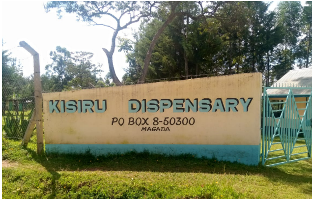
Kisiru Dispensary in Vihiga sub - county

Continuous implementation of supportive supervision generates sustained performance improvement, motivation of health workers and quality service delivery.