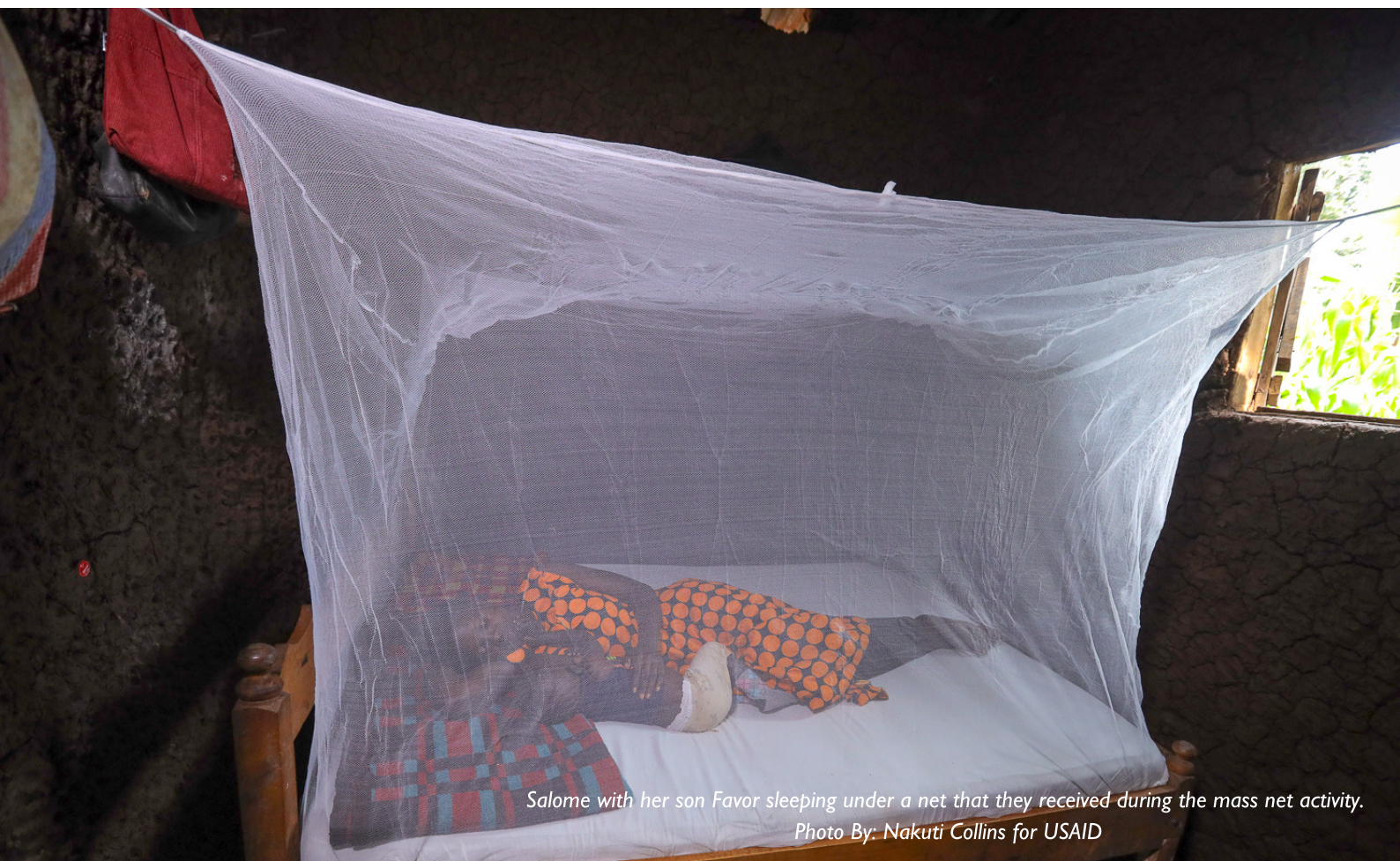
Salome with her son Favor sleeping under a net that they received during the mass net activity.