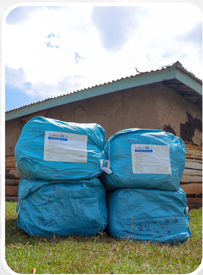
Bales for PBO nets distributed to beneficiaries

Since LLIN distribution targeted households, Bungoma county engaged a pool of over 8,000 community health volunteers (CHVs) and village elders who moved door-to-door across the 4,200 villages to register the households and educate the family members on proper use and maintenance of the LLINs. In addition to these malaria messages, residents were issued with vouchers which contained the name of the distribution post where they would collect their net and the page number where the household appears thereby averting confusion and crowding; one of the many measures of preventing the spread of Covid19. Household heads redeemed their LLINs in over 800 strategic distribution sites.