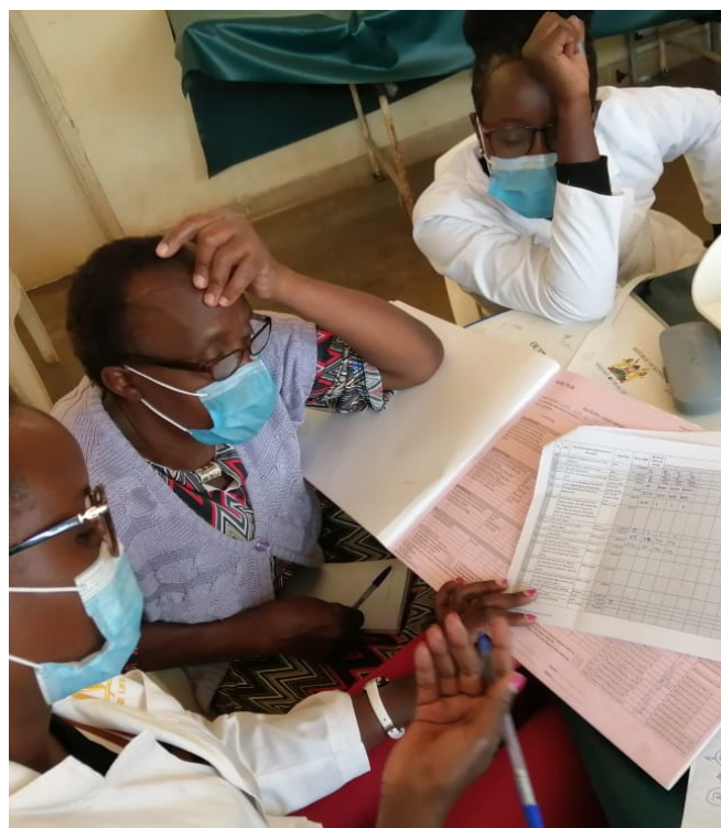
Data collection in a health facility in Embu County

“Quantification is the process of estimating quantities and costs of HPTs required for a specific period and determining when shipments of the products should be delivered to ensure an optimal and uninterrupted supply.”