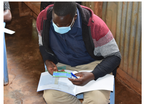
Participants during the healthcare workers training sessions in Mt. Elgon and Cheptais sub counties