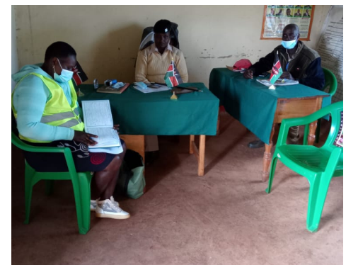
Household registration process across the various counties