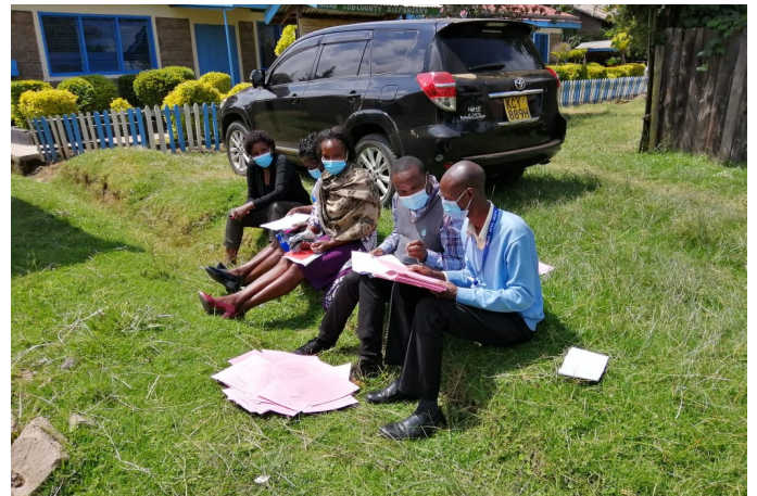
Participants during quantification data collection in Machakos County