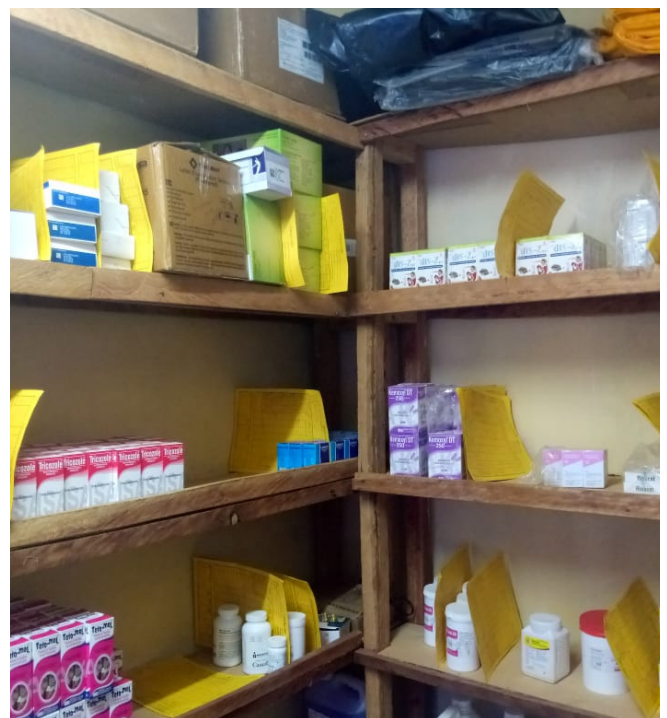
The new and improved store at the dispensary.