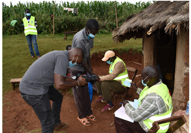
Documenting the household registration process by community health volunteers.